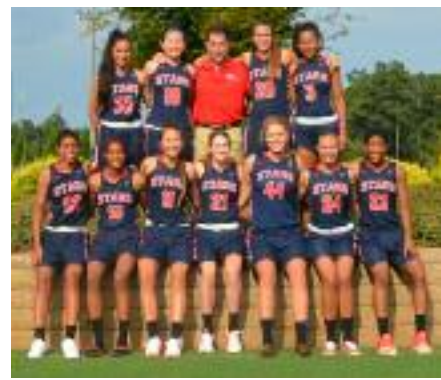
Cal Stars AAU girls' basketball team